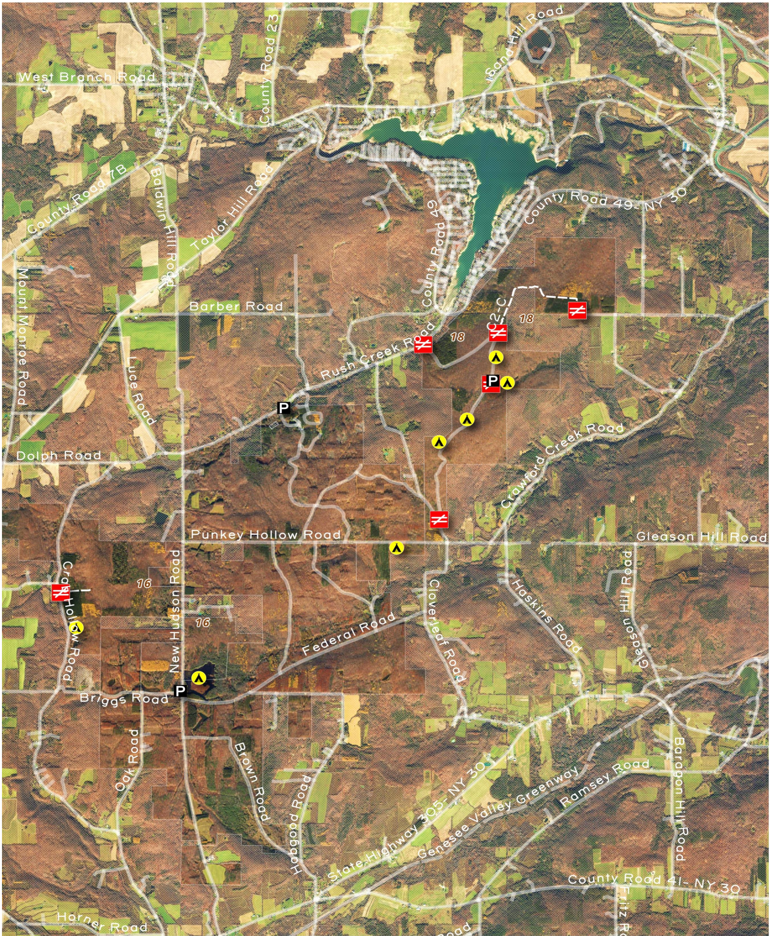
Hanging Bog Wildlife Management Area in Allegany County spans over 4,500 acres of rolling hills, dense forests, and marshes. Its namesake is a unique man-made pond featuring a floating mat of vegetation. Managed for conservation, it is a premier destination for hunting, trapping, birding, and hiking.